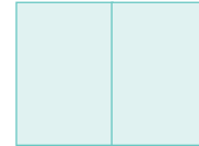
Spread 420 x 297 mm