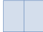
Spread 420 x 297 mm