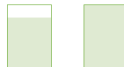
Back cover 1/1 210 x 262 mm 1/1 210 x 297 mm