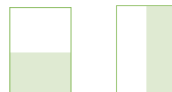
1/2 horizontal 210 x 146 mm 1/2 vertical 102 x 297 mm